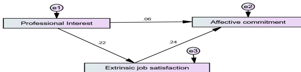
Figure 1: Mediation effect of extrinsic job satisfaction

The effect analysis indicated that professional interest has no significant effect on affective commitment ( \beta=0.053 ; P-value=0.329). This is unexpected and not in line with the existing theory and literature. Hence, mediation analysis was conducted to see if the effect of professional interest on affective commitment is mediated by extrinsic job satisfaction. As expected, the total effect was found to be significant ( \beta=0.117 ; P-value=0.031). But the direct effect of the moderation model is insignificant ( \beta=0.063 ; P-value = 0.197). However, the indirect effect of the model is to be statistically significant ( \beta=0.053 ; P-value = 0.001). The Extrinsic satisfaction fully mediates the relationship between professional interest and affective commitment.